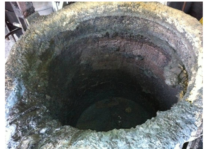
Ladle 7 tons after 125 heats and still running