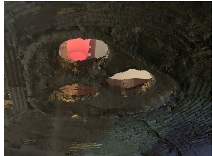
After 420 cycle heats or around 600 hours with 1550-1570°C operating temperature