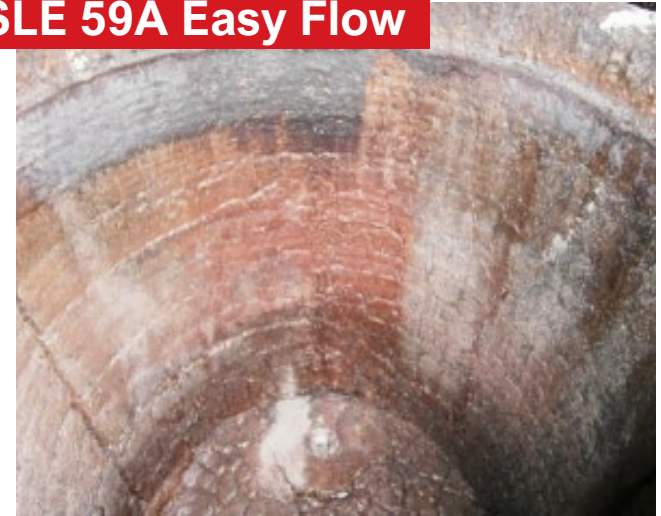
Ladle after 23 cycle heats